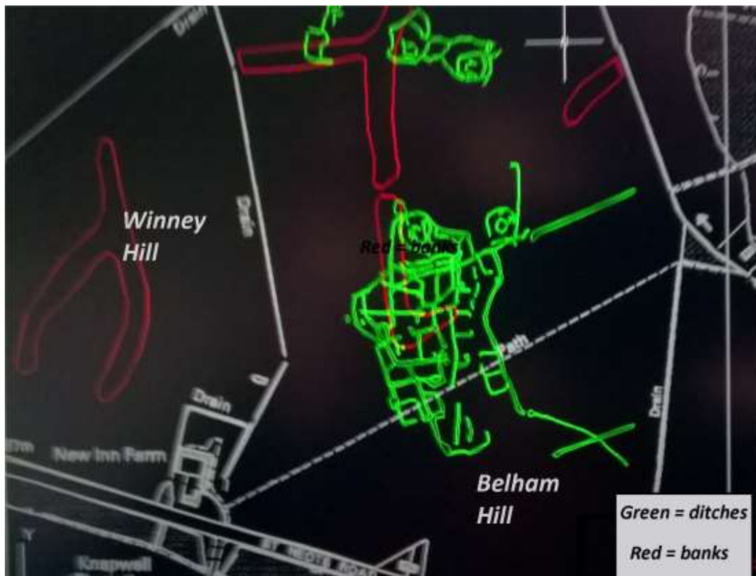
Figure 1. Combined aerial photo/Lidar interpretation of landscape features in Belham Hill.

Childerley which is too far away but the Historic England aerial and lidar interpretation does indicate a likely settlement nearby in Belham Hill. Its date is unclear – it may be from the Iron Age to the medieval period. This will be investigated as part of our on-going survey of the south-west corner of the estate.