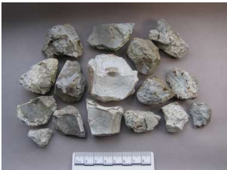
Photograph 1. View of some of the burnt flint from Great Park

Very few interesting items have been found this time but the burnt flint cluster is significant.